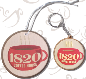
Air Freshener Key Chain

Our Subscription Boxes launched in June and they were an instant hit. If you haven't signed up yet, you can do so on our website at 1820CoffeeHouse.com/Subscription . This is a recurring monthly subscription. It is "local" and includes a bag of our regular coffee (Texas Pecan, Medium or Dark Roast) and one specialty coffee (not typically available at the coffee house). In addition to the coffee, we are including some special swag not available anywhere else. If you want to be in the know you have to sign up at 1820CoffeeHouse.com/Subscription . It is not too late to sign up for next month's!